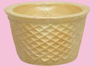
EDIBLE BAKING CUPS LARGE