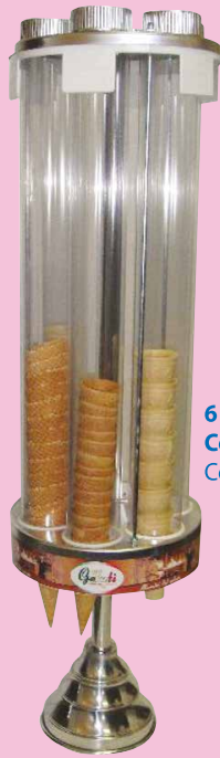
6 Tube Gelati Cone Holder Code: 1140