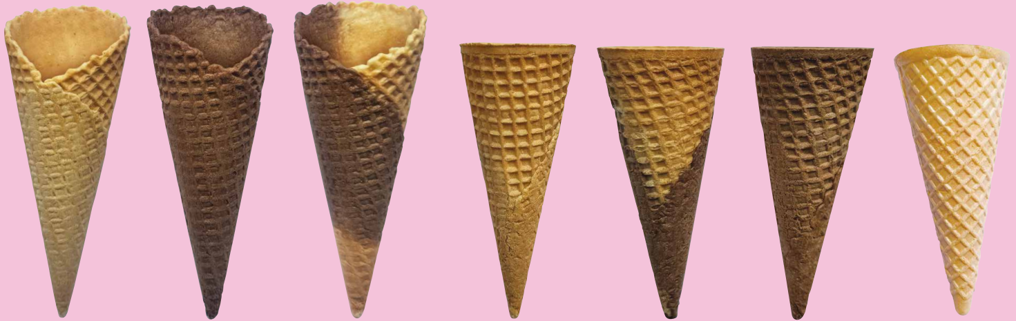
Large Sugar Cones - Vanilla