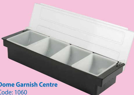
Dome Garnish Centre Code: 1060