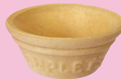
EDIBLE BAKING CUPS SMALL