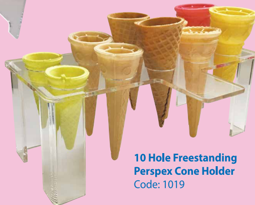
10 Hole Freestanding Perspex Cone Holder Code: 1019