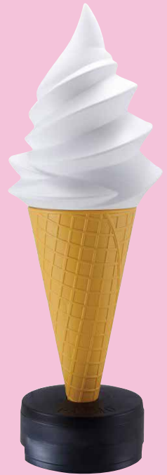
1.53m Display LED Sugar Cone Code:1057