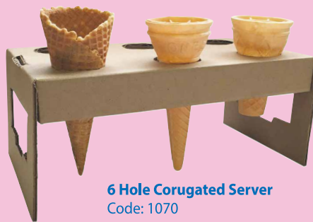
6 Hole Corrugated Server Code: 1070