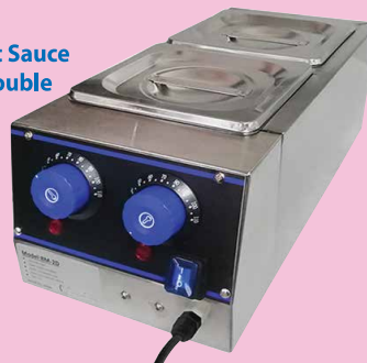
Dip Au Lait Sauce Warmer Double Code: 1082