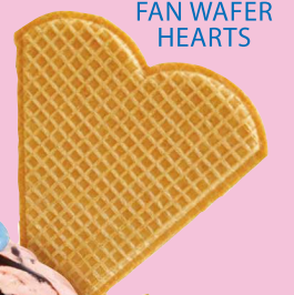
FAN WAFER HEARTS