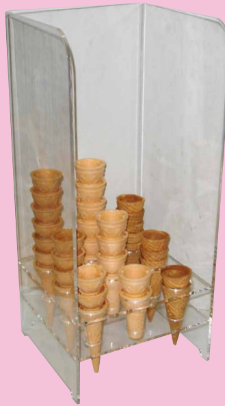
9 Hole Perspex Display Stand Code: 1122