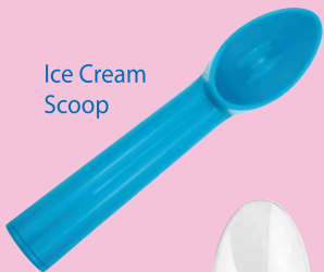
Ice Cream Scoop