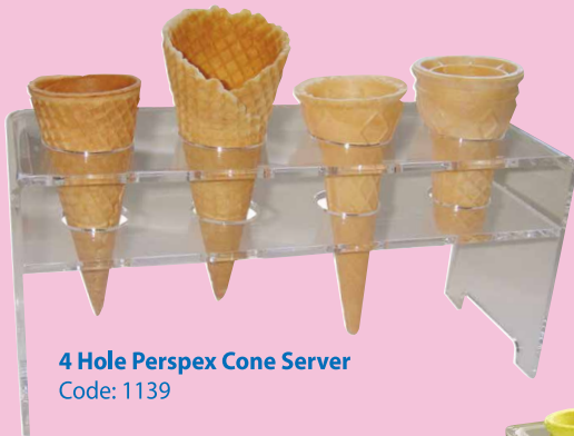
4 Hole Perspex Cone Server Code: 1139