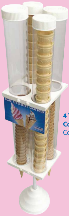
4 Tube Gelati Cone Holder Code: 1142