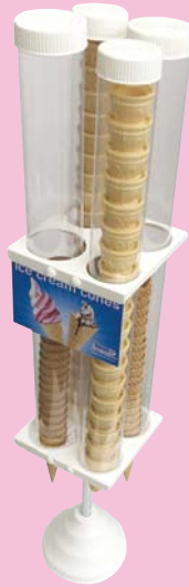
4 Tube Gelati Cone Holder Code: 1142 Case Pack: 1 B/Code: 16001622011420