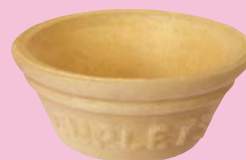
EDIBLE BAKING CUPS SMALL