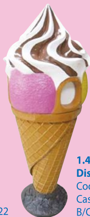
1.4m Fibre Glass Display Cone BIN Code: 1183 Case Pack: 1 B/Code: 16001622011833