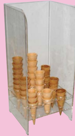
9 Hole Perspex Display Stand Code: 1122 Case Pack: 1 B/Code: 16001622011222