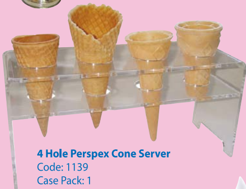
4 Hole Perspex Cone Server Code: 1139 Case Pack: 1 Unit: 300 B/Code: 16001622011390