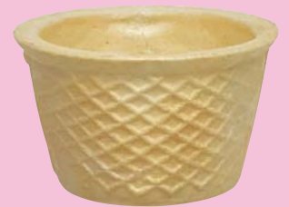
EDIBLE BAKING CUPS LARGE