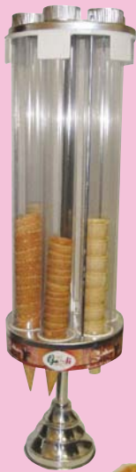
6 Tube Gelati Cone Holder Code: 1140 Case Pack: 1 B/Code: 16001622011406