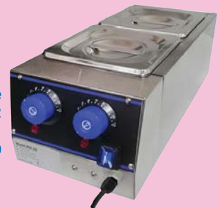
Dip Au Lait Sauce Warmer Double Code: 1082 Case Pack: 1 B/Code: 16001622010820