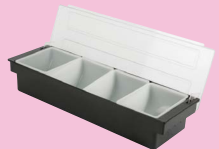
Dome Garnish Centre Code: 1060 Case Pack: 1 B/Code: 16001622010607