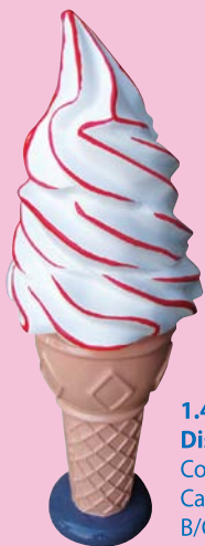
1.4m Fibre Glass Display Cone Code: 1062 Case Pack: 1 B/Code: 16001622010622