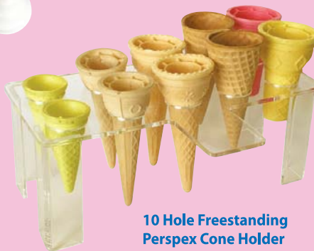
10 Hole Freestanding Perspex Cone Holder Code: 1019 Case Pack: 1 B/Code: 16001622010195