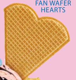
FAN WAFER HEARTS