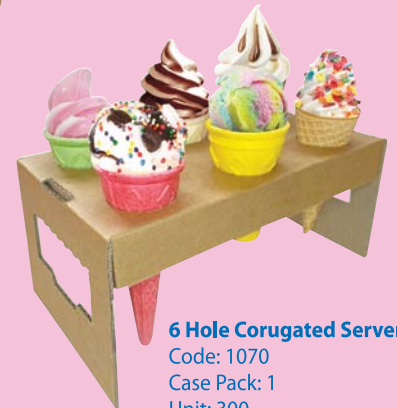
6 Hole Corugated Server Code: 1070 Case Pack: 1 Unit: 300 B/Code: 16001622010706