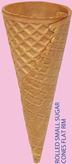
ROLLED SMALL SUGAR CONES FLAT RIM