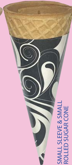
SMALL SLEEVE & SMALL ROLLED SUGAR CONE