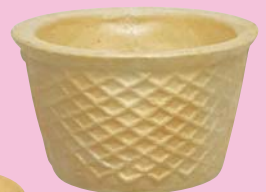
EDIBLE BAKING CUPS LARGE