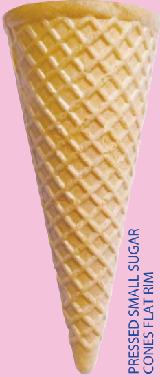
PRESSED SMALL SUGAR CONES FLAT RIM