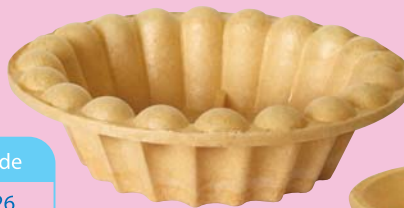
EDIBLE FLUTED BOWL