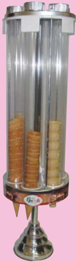
6 Tube Gelati Cone Holder