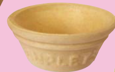
EDIBLE BAKING CUPS SMALL