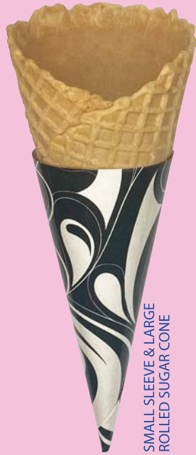
SMALL SLEEVE & LARGE ROLLED SUGAR CONE