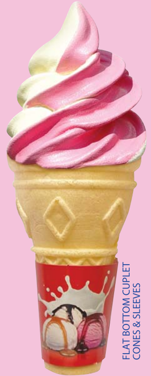
FLAT BOTTOM CUPLET CONES & SLEEVES