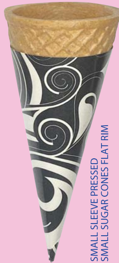
SMALL SLEEVE PRESSED SMALL SUGAR CONES FLAT RIM