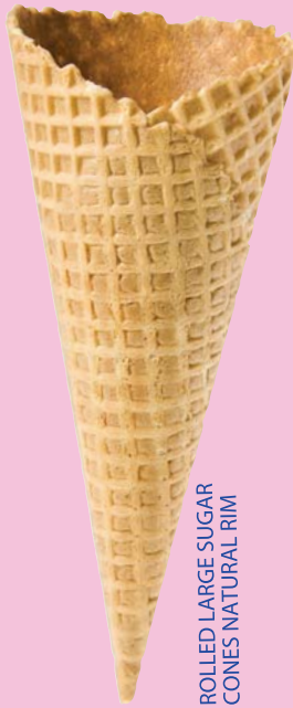
ROLLED LARGE SUGAR CONES NATURAL RIM