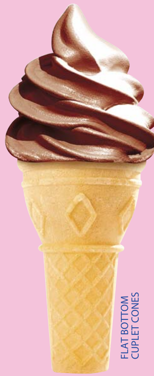
FLAT BOTTOM CUPLET CONES