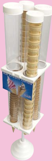
4 Tube Gelati Cone Holder